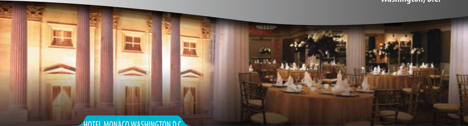
HOTEL MONACO WASHINGTON D.C.